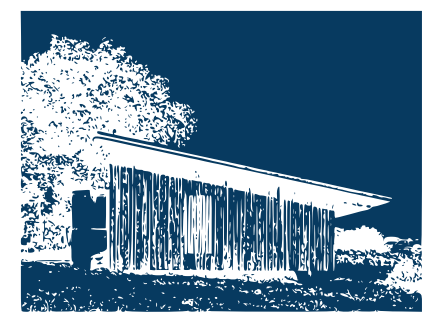
SUSTAINTABILITY AND PRODUCT CERTIFICATION

Seistag* is a young company in which technical and market knowledge are integrated. Work scope is always the industry collaboration. Company aim is to develop new bussines line through the innovation and the internationalization.